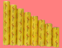
Food Wrap (#6795)