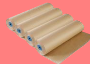
Masking Paper (#9586)