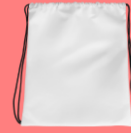
Drawstring Bag (#6796)