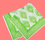
Printed Napkin (#9587)