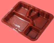
Bento Box (#6799)