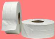
Jumbo Toilet Roll (#9594)