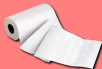
Kitchen Towel (#9588)