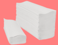
Hand Towel (#9595)